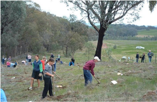
Students planting a wildlife corridor in 2007