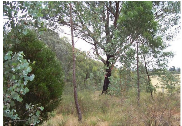
And 8 years later we have excellent habitat!

These pictures are typical of the changes that students have made on our local environment. And they have helped to us to plant over 500 such sites in the past 20 years. The best news is that threatened birds and mammals move in only 4 or 5 years after planting.